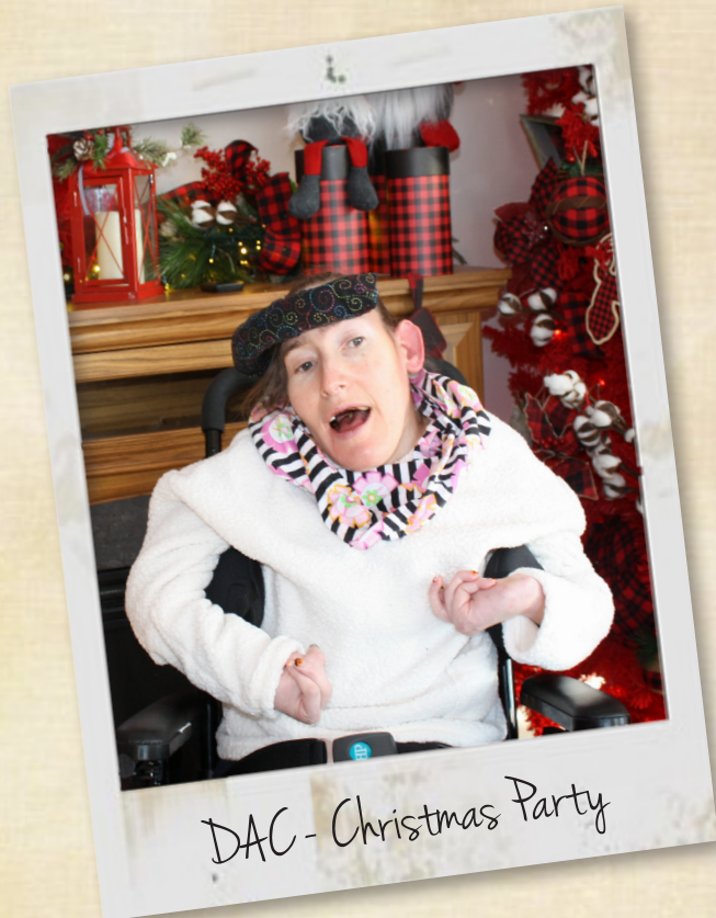
DAC - Christmas Party

Serving Western Polk County with Locations in Crookston & East Grand Forks, Minnesota