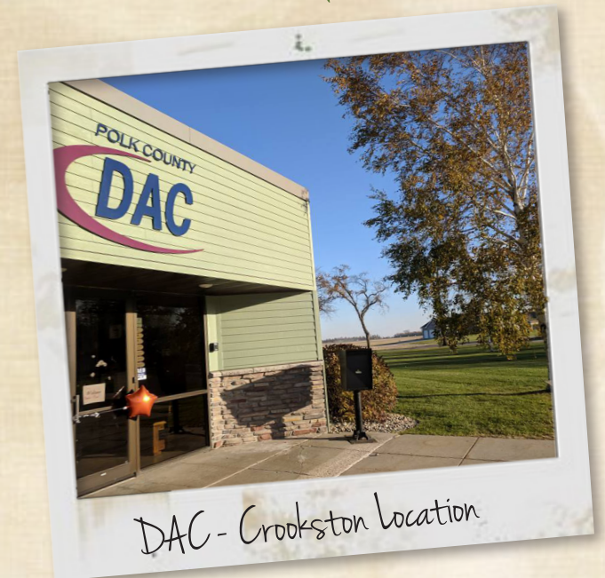
DAC - Crookston Location

POLK COUNTY DEVELOPMENTAL ACHIEVEMENT CENTER