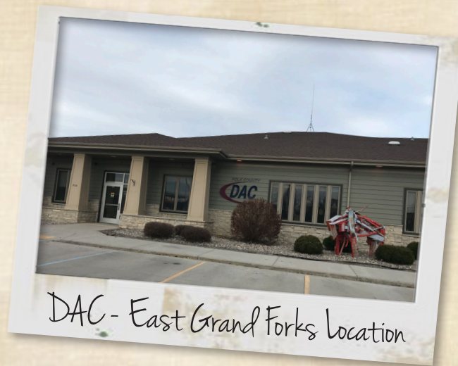
DAC - East Grand Forks Location

Our staff works with each individual to help them participate in community life.